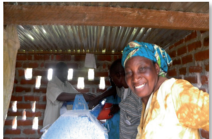
Hammer Mill in use by a CBO in Mumbwa district

Volunteers are at the heart of the care and support services provided by CBOs for people living with and affected by HIV and AIDS. They provide a wide range of services including psycho-social counselling, HBC, treatment adherence support, peer education and sensitisation. The numbers of volunteers in individual CBOs in Mumbwa ranged from 10 to 110. They would walk long distances to provide HBC to families living with HIV and AIDS and to bring reports to the DATF. Most CBOs reported a decrease in volunteer numbers since CRAIDS ceased. A decrease in the morale of volunteers was frequently lamented by interviewees, primarily due to a lack of materials to carry out their work, such as HBC kits, washing and cleaning materials. Some had resigned due to work overload.